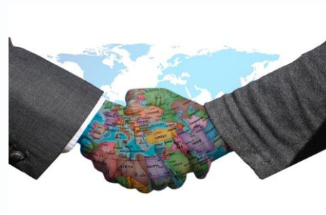
Restoring America's Global Standing