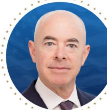
Alejandro Mayorkas Secretary of Homeland Security

Click Here to View the Biden-Harris Administration Cabinet