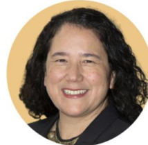
Isabel Guzman Small Business Administrator