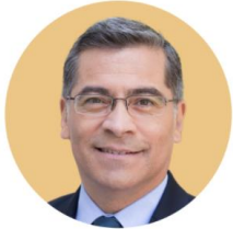
Xavier Becerra Secretary of Health and Human Services