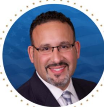
Dr. Miguel Cardona Secretary of Education