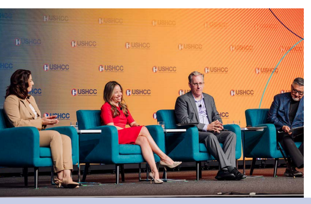
Increased brand exposure postconference via USHCC social media channels